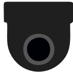
Ip50 series (Multi Layered Deep Learning AI Analytics at Edge)